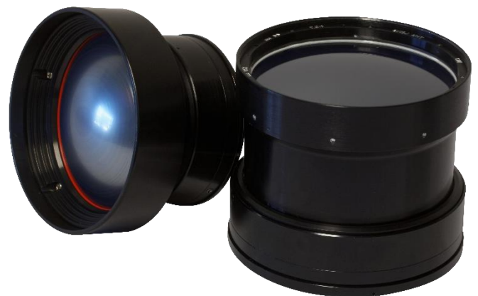
Fast Optics F/0.95