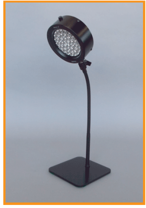
Flexible Tube Stand