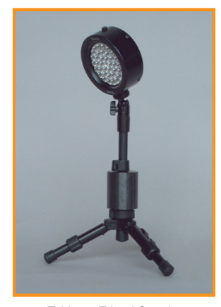
Tabletop Tripod Stand