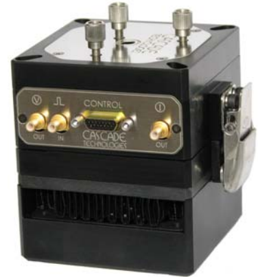
Aesthetic design subject to change without prior notice